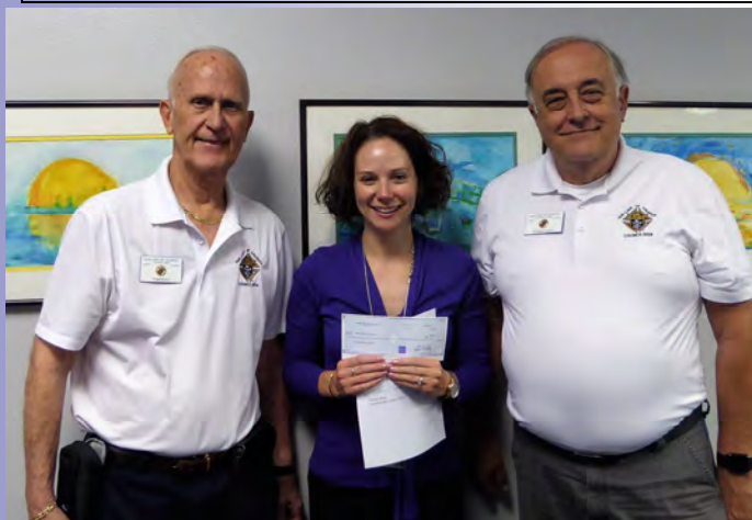
(Top left.) Check Presentation to Venice Elementary School Special Ed. (Top right) Loveland Center

Checks were delivered to Venice Elementary Sp. Ed., Special Olympics, Loveland Center, Instride Therapy and Autism Speaks. It is a humbling and inspirational experience to visit these organizations. The work they do with the intellectually disadvantaged is amazing. Better yet, the way they cooperate with each other further multiplies their value. What we do means a lot – but it pales in comparison to what these organizations do. These charities are truly worthy of our support!