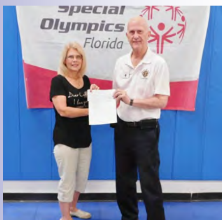
(Bottom left) Special Olympics.