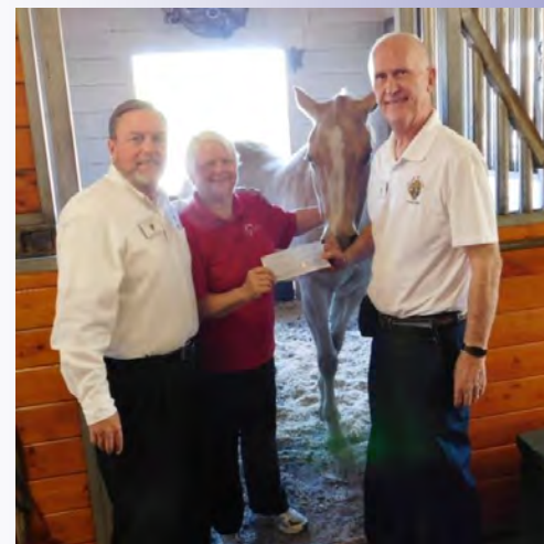
(Bottom right). Instride Therapy