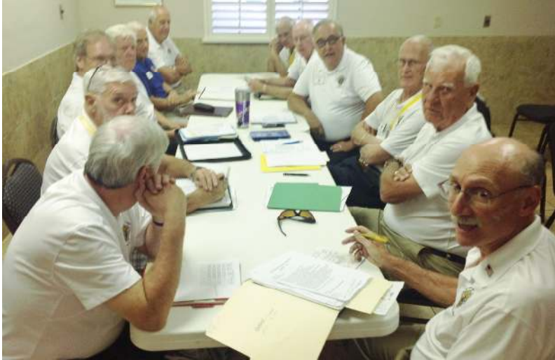
Your Board hard at work