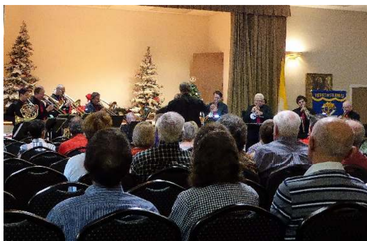
Beginning of our Christmas Concert