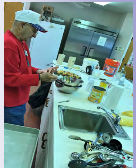
(right) Preparation of the Council meals