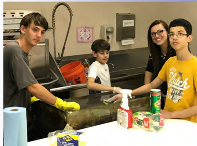
The youth group cleaned our grills & refrigerators as a thank you for our support of their Summer

The Board approved the purchase of a defibrillator for the parish to be placed in the parish center. A Knight heard about the need and purchased the defibrillator on his own. Thank You for your generosity