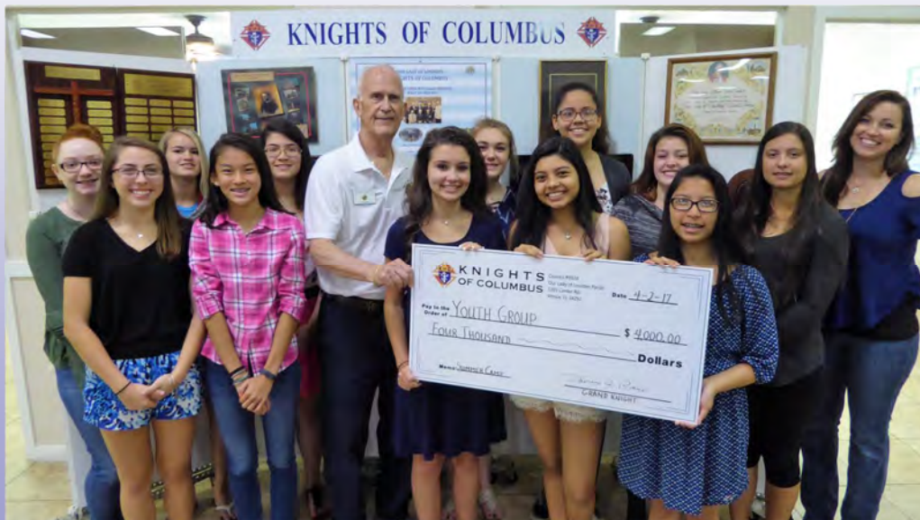
Kids To Camp check presented to the kids of our parish. The money was much appreciated. Thank you council and our anonymous donors.