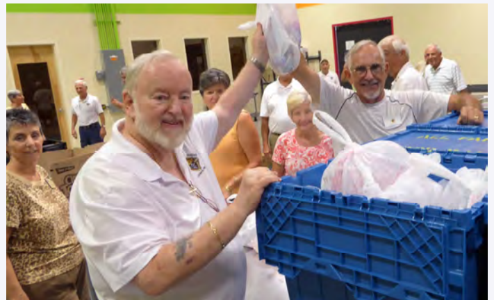
The record setting bag.