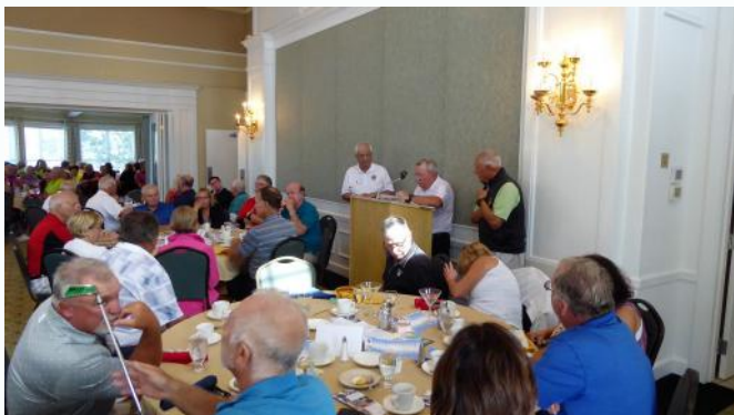
And the winners is.....