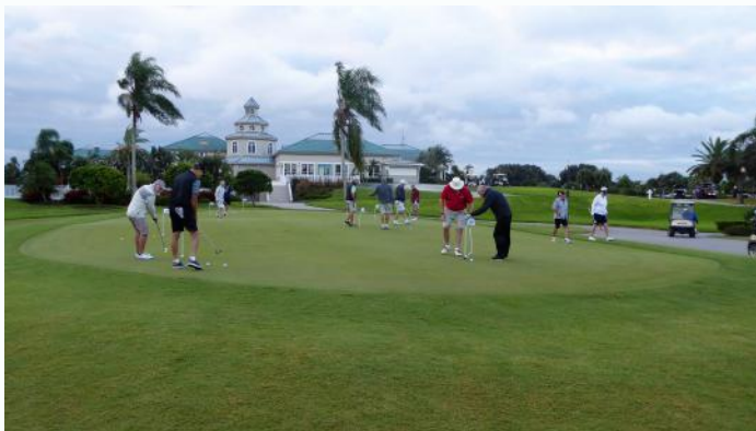
Practicing our puts