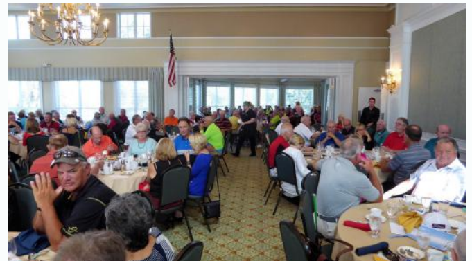
After the game lunch