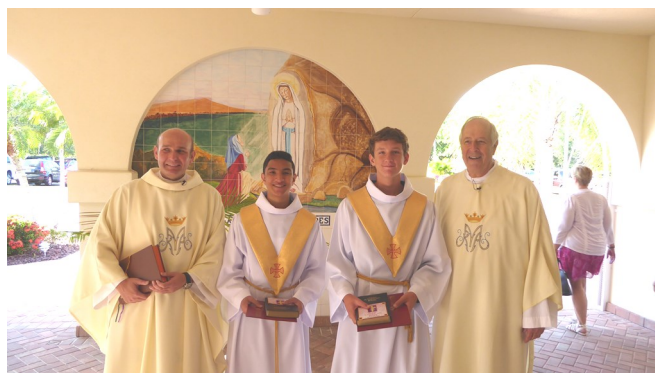
Altar Server Awards