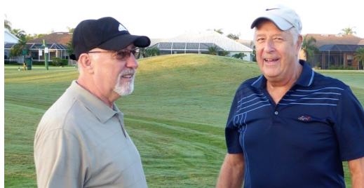
Circle of Life Golf Outing