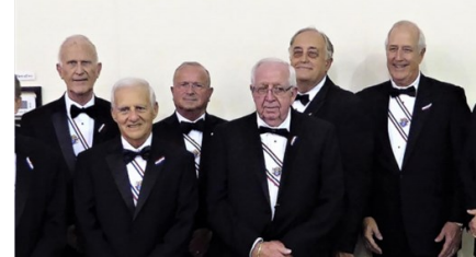
Fourth Degree Installation